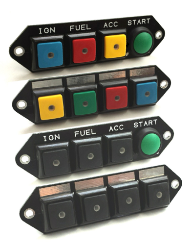
PDM Switch Panels

The 4 channel Power Distribution Module from CARTEK has been designed to replace the functions of fuses, circuit breakers and relays in one small, fully electronic unit.